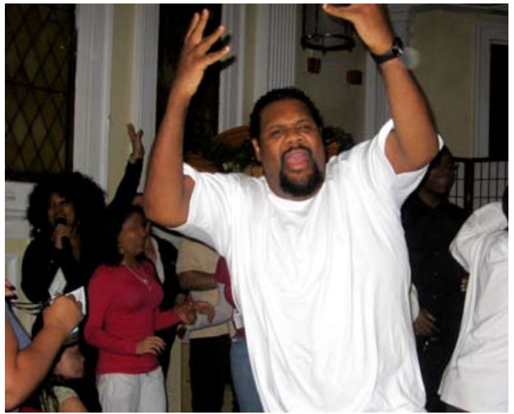
Fatman Scoop gets the party jumping at Incarnation Children's Center, a skilled nursing facility providing specialized care for children and adolescents living with HIV/AIDS. Scoop, a hip-hop star who has commanded packed arenas, calls his work with LIFEbeat's Hearts & Voices program some of the most uplifting and meaningful of his career.

The 2008 holiday season provided holiday entertainment at all of the Hearts & Voices facilities throughout the month of December. There were seven 'Superstar' shows with 3 or more Hearts & Voices artists or bands performing together, each coinciding with handing out the holiday gift bags. Among the many gifts in each gift bag there was a 2008 Hearts & Voices Superstar CD, a compilation of 17 tracks from the most popular artists on our roster in 2008.