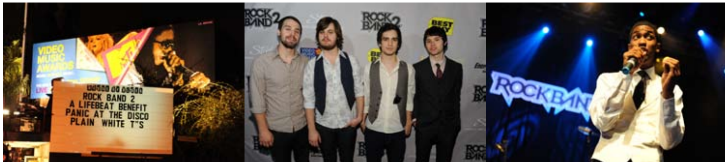
The Rock Band 2 Party to Benefit LIFEbeat, held at the House of Blues in Los Angeles, featured performances by Panic at the Disco and Plain White T's and was hosted by Farnsworth Bentley.