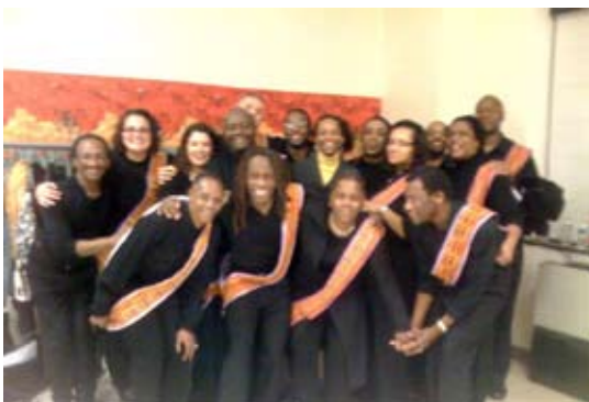
The Lavendar Light Gospel Choir (above) and The Imperial Court of New York (right) brought their inspirational live shows to appreciative residents.